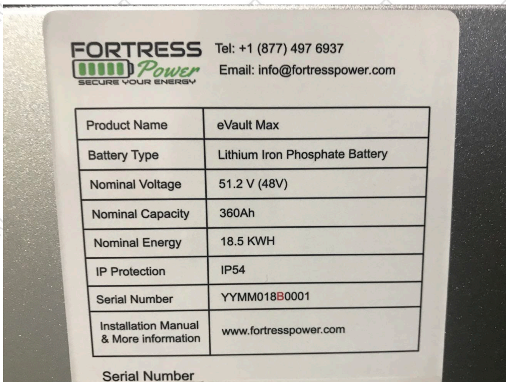
Figure 4 Battery Label