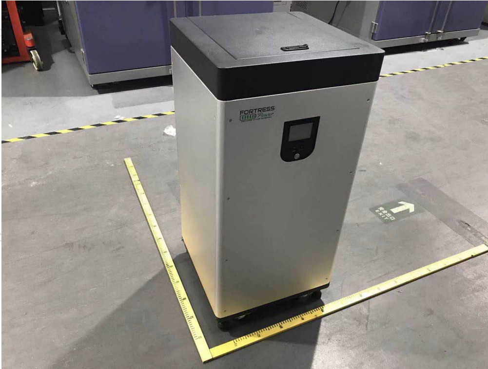
Figure 1 Overall view I of battery (外观图I)