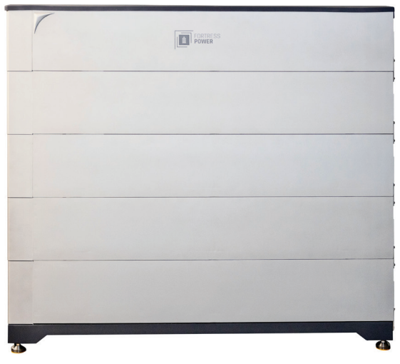
BMS with four 4.9kWh modules shown