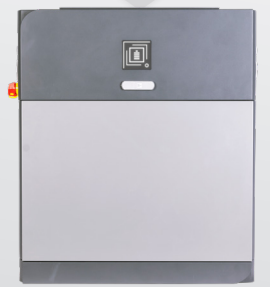
eForce 9.6 kWh